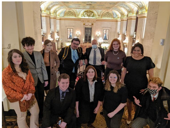
MCLA's 2022 MUN Delegation in Chicago