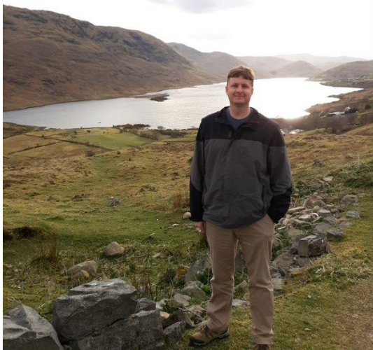
Near Lough Mask in County Mayo, Ireland

I also visited Belfast, to do archival research for a week in the Sharman Crawford papers at the Public Record Office of Northern Ireland (PRONI). It is exciting to be able to work with materials from the era, and while in Belfast I was also able to do some preparation work for a 2024 travel course to Ireland.”